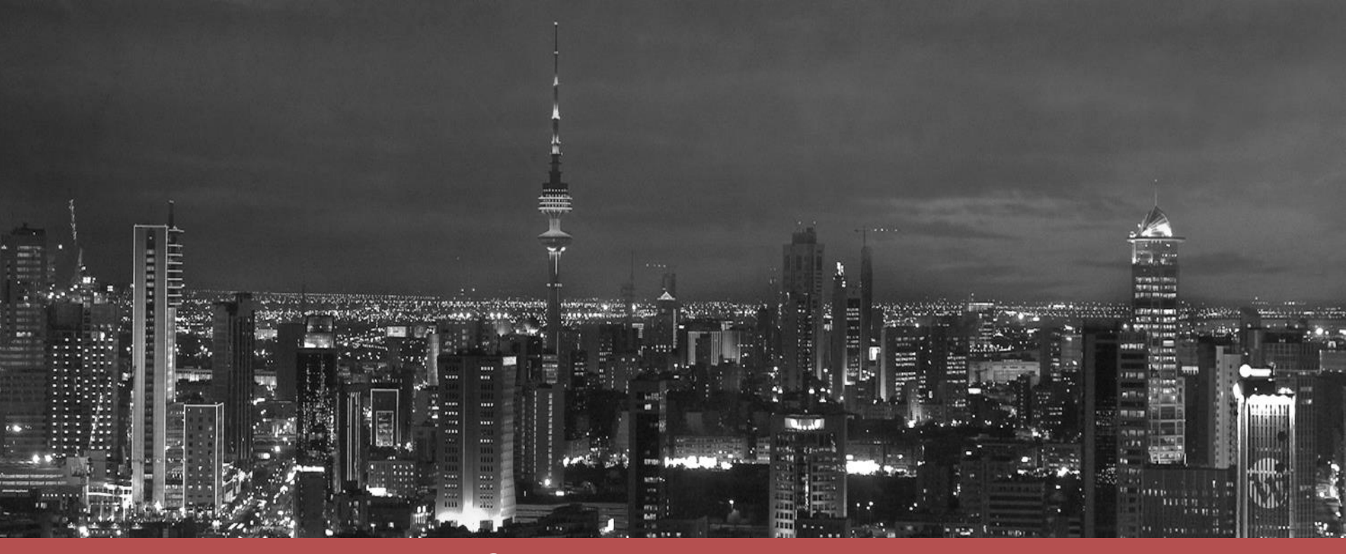
Boubyan Petrochemical Company Investor Update – 31 October 2019 results