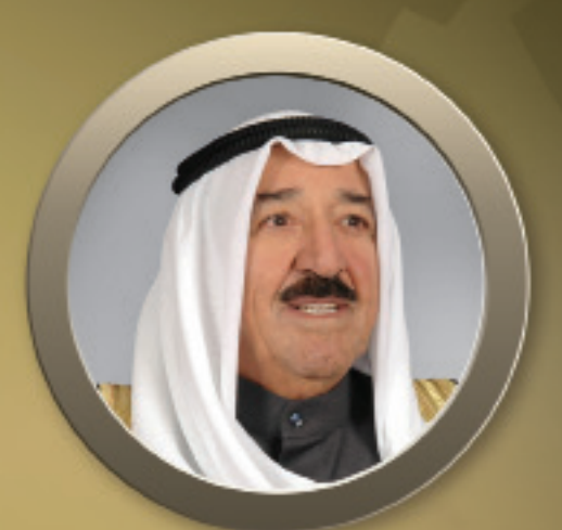
H.H. / Sheikh Sabah Al-Ahmad Al-Jaber Al-Sabah The Amir of The State of Kuwait